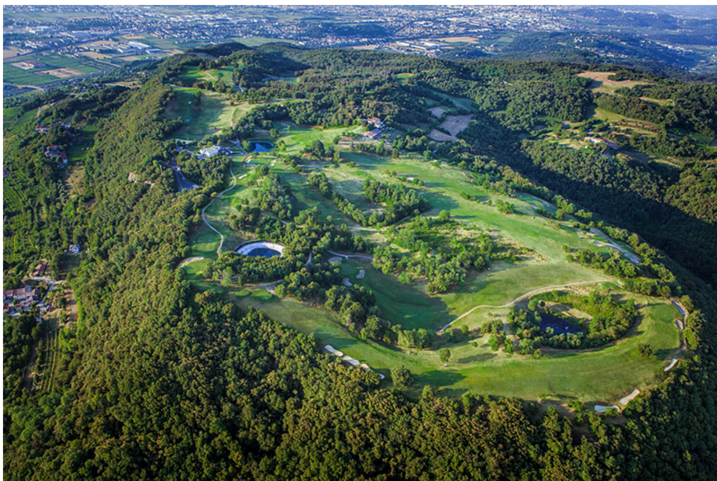
Colli Berici Vicenza – Padua – Verona

The package can be completely modified according to your needs