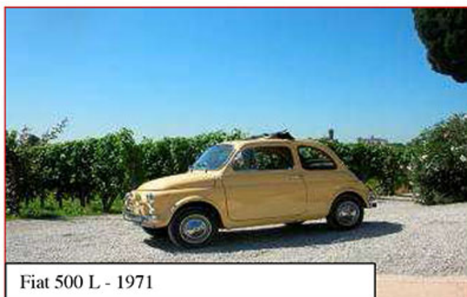
Fiat 500 L - 1971