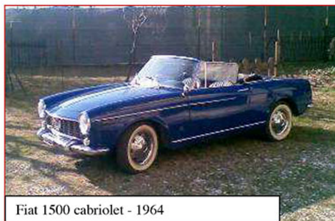
Fiat 1500 cabriolet - 1964