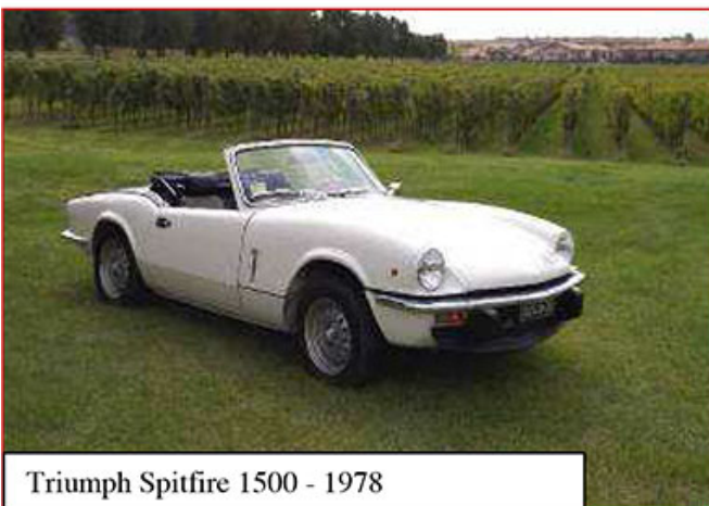
Triumph Spitfire 1500 - 1978