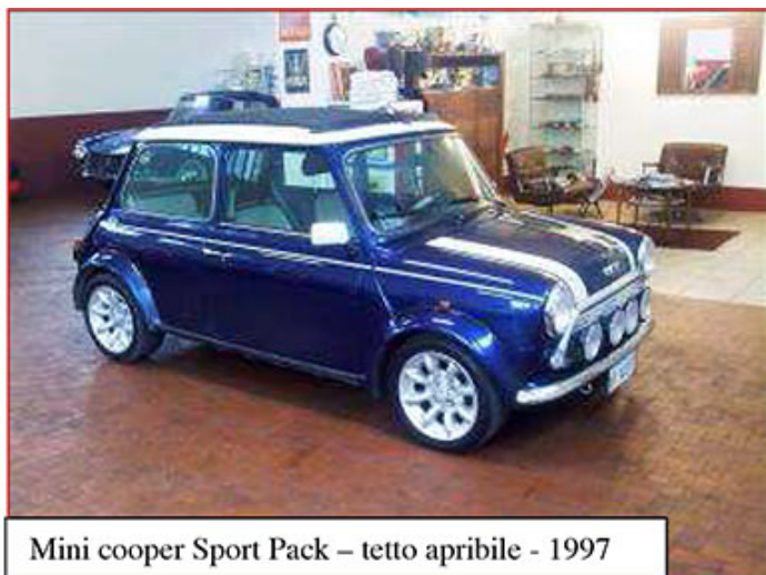
Mini cooper Sport Pack – tetto apribile - 1997