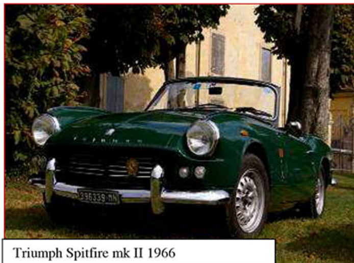
Triumph Spitfire mk II 1966