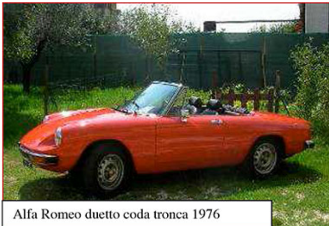
Alfa Romeo duetto coda tronca 1976