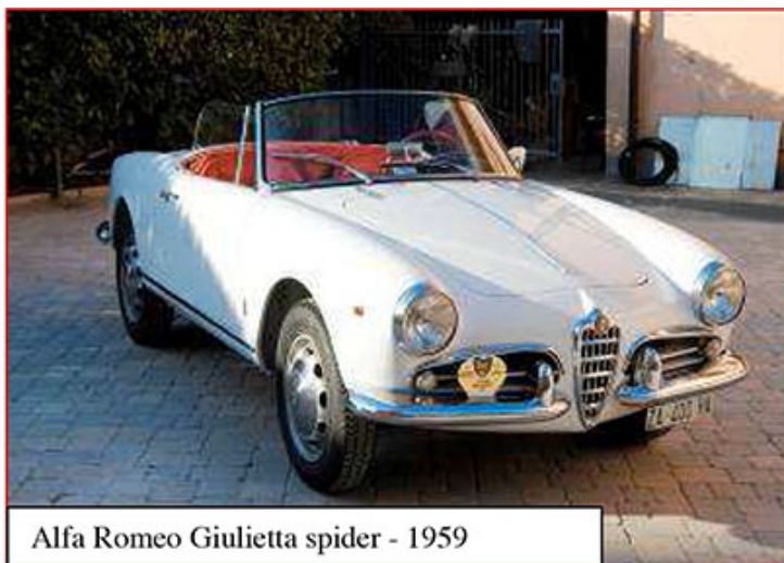
Alfa Romeo Giulietta spider - 1959