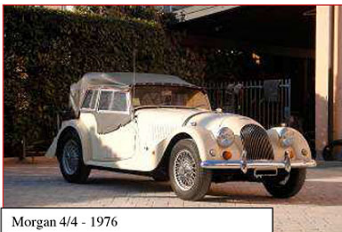
Morgan 4/4 - 1976