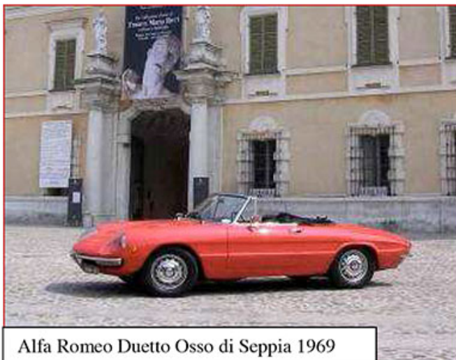
Alfa Romeo Duetto Osso di Seppia 1969