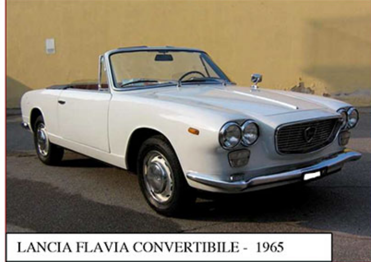
LANCIA FLAVIA CONVERTIBILE - 1965