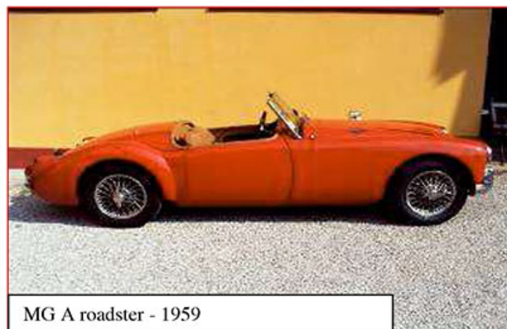
MG A roadster - 1959