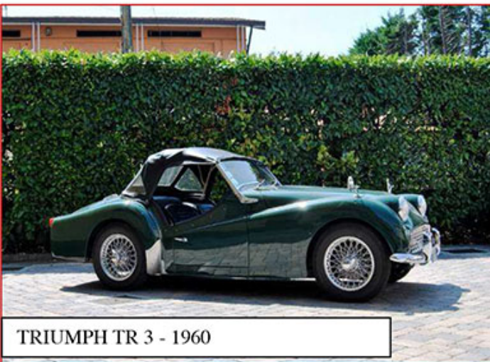
TRIUMPH TR 3 - 1960