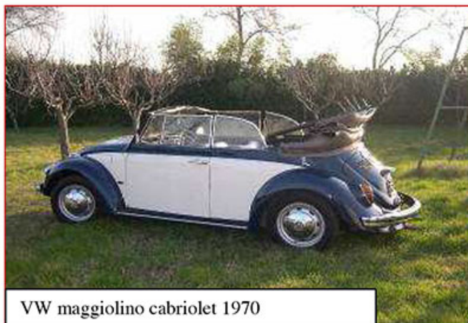
VW maggiolino cabriolet 1970